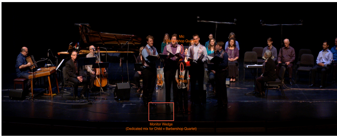
Stage with Barbershop Quartet and Child